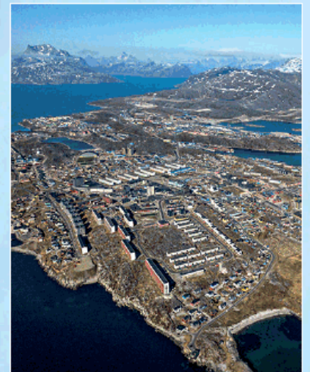
Greenland's capital Nuuk is closer to New York than to Copenhagen