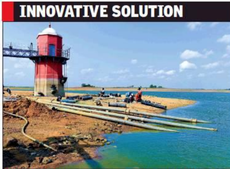
COUNTING DROPS: Thanks to the new plants, water from reservoirs, like the one in Red Hills, will be used for domestic purposes