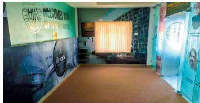
AIR Cafe under construction on SOEL premises in Taramani